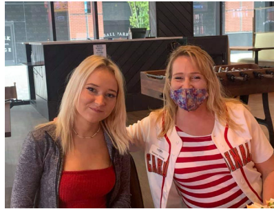
[Chapter Officer right, with family]