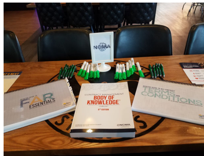
[Door prizes & hand sanitizer]

Thanks for joining us and see you at the next one!